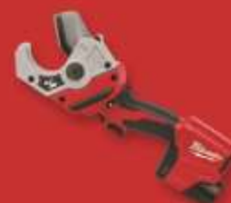
M12™ Plastic Pipe Shear Kit 2470-21