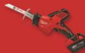
HACKZALL® M18™ One-Handed Reciprocating Saw Kit 2625-21