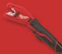
M12™ Copper Tubing Cutter Kit 2471-21