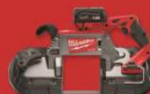
M18 FUEL™ Deep Cut Band Saw Kit 2729-22